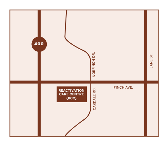
Finch Site: 2111 Finch Avenue West, North York

For more savings, you can purchase a new H Pass at both Reactivation Care Centres.