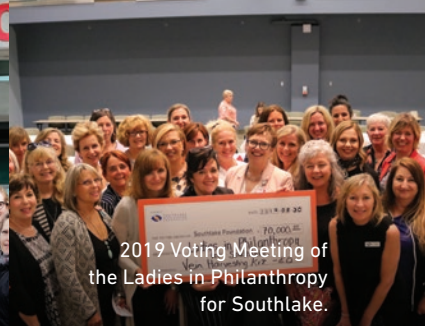
2019 Voting Meeting of the Ladies in Philanthropy for Southlake.