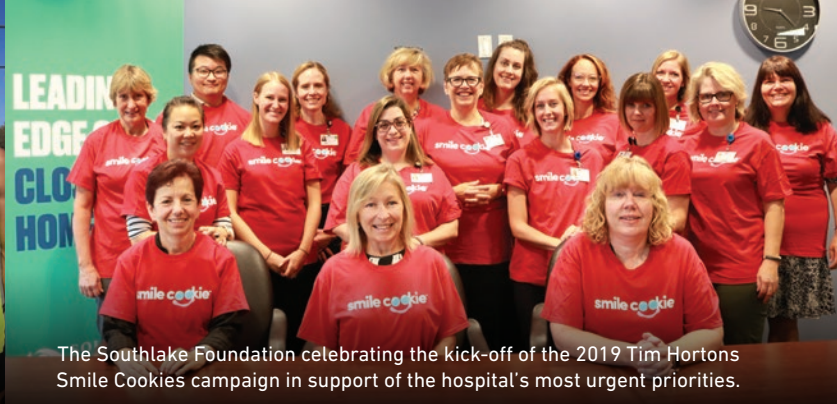
The Southlake Foundation celebrating the kick-off of the 2019 Tim Hortons Smile Cookies campaign in support of the hospital's most urgent priorities.