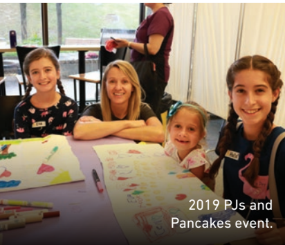
2019 PJs and Pancakes event.