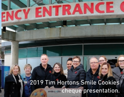
2019 Tim Hortons Smile Cookies cheque presentation.