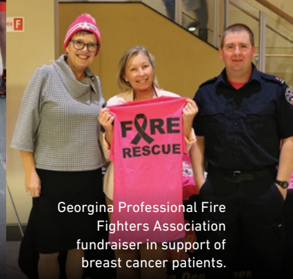
Georgina Professional Fire Fighters Association fundraiser in support of breast cancer patients.