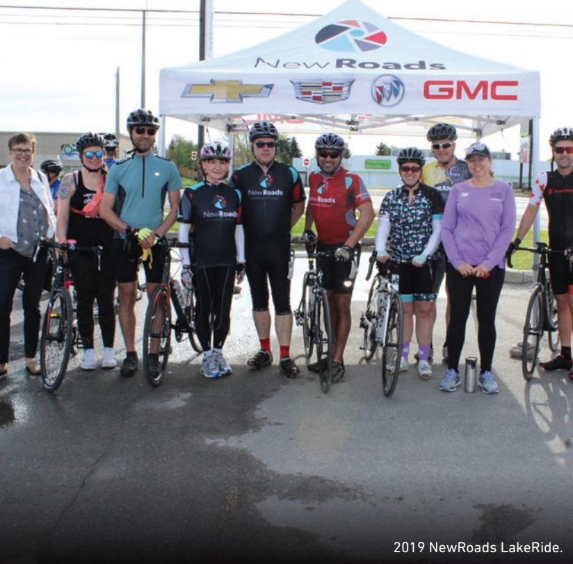
2019 NewRoads LakeRide.