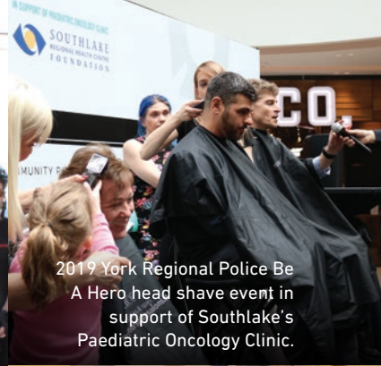
2019 York Regional Police Be A Hero head shave event in support of Southlake's Paediatric Oncology Clinic.