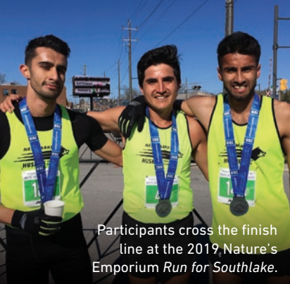
Participants cross the finish line at the 2019 Nature's Emporium Run for Southlake.