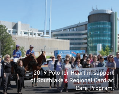
2019 Polo for Heart in support of Southlake's Regional Cardiac Care Program.