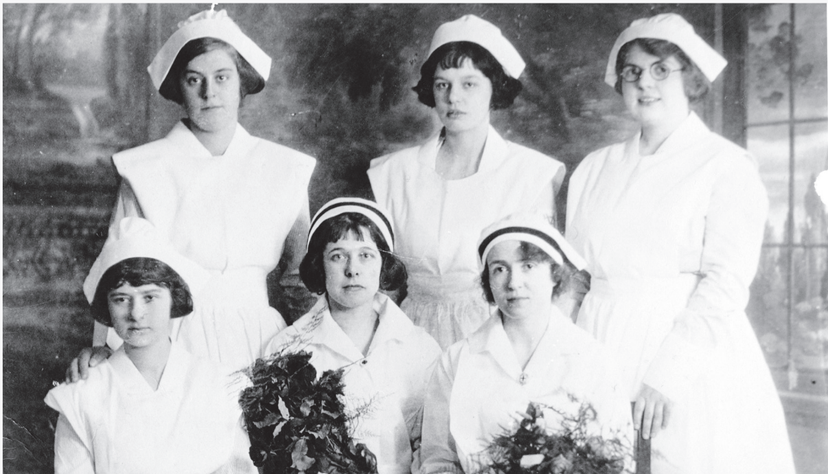
YORK COUNTY HOSPITAL NURSES, 1924