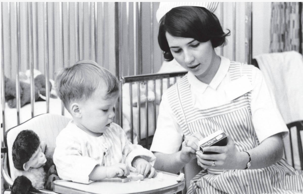
CANDY STRIPPER PLAYING WITH CHILD, 1960S