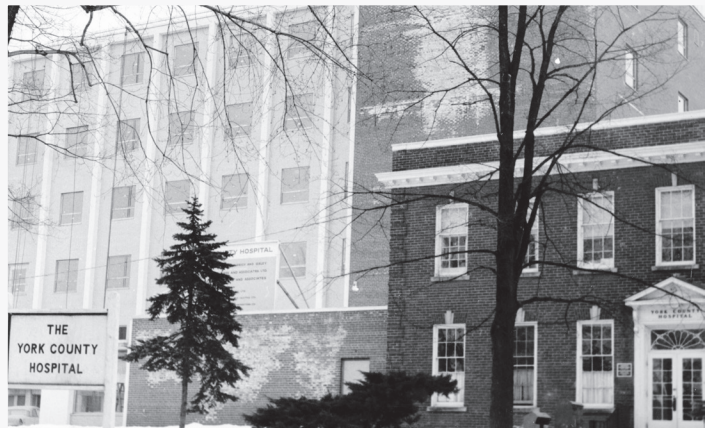
EAST WING FACILITY, 1965