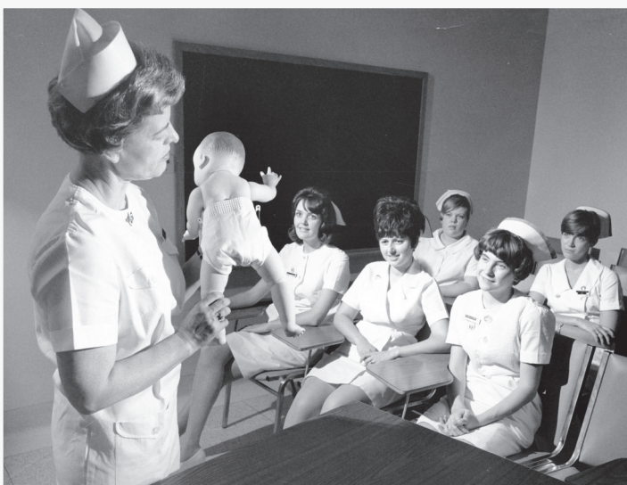
NURSES TRAINING FOR CARE OF NEWBORNS, 1960S