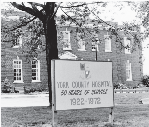
NORTH WING, 1971