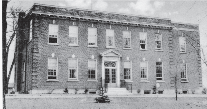
YORK COUNTY HOSPITAL, 1950S